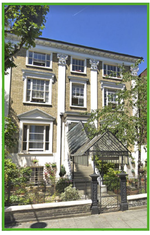
P20 Homes for armed force veterans