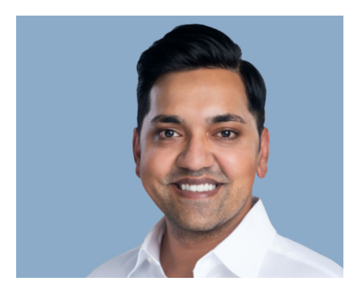
Embarking on a journey of transformation as the new Customer Experience Director

I'm beyond thrilled to share with you the exciting initiatives we're embarking on to redefine and elevate our customer experience. As the new Customer Experience Director, my primary focus is to enhance every aspect of customer interactions with Notting Hill Genesis. I bring plenty of experience, energy and passion for driving positive change' My role is not just a title; it's a commitment to