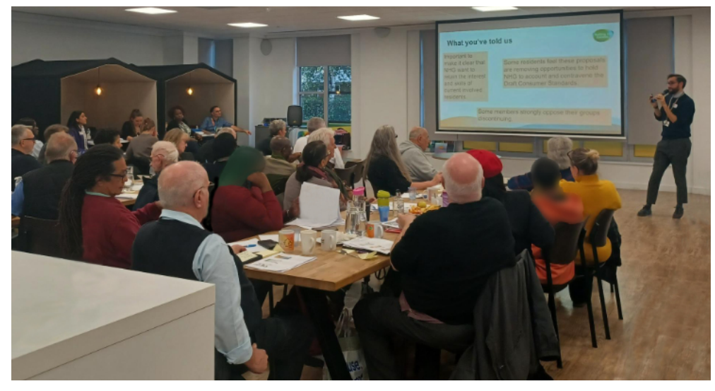
Resident Involvement evaluation day at Bruce Kenrick House November 2023

Click inside the text box or scan the QR code to email or call the involvement team