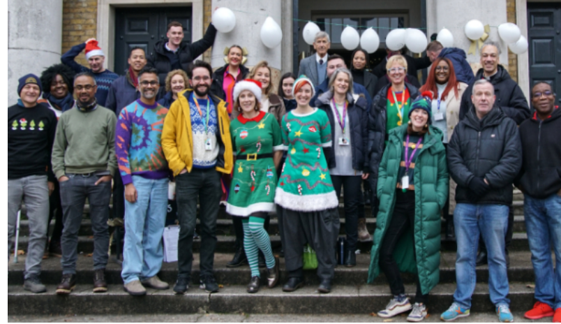
Top left: Staff and residents community garden project 2023 Top right: Resident Involvement evaluation day November 2023 Bottom left: Urban Gamez, Grahame Park summer 2023 Bottom right: Aylesbury Christmas event 2023 Cover: St. Martin's resident mural in Lambeth October 2023, residents and staff.