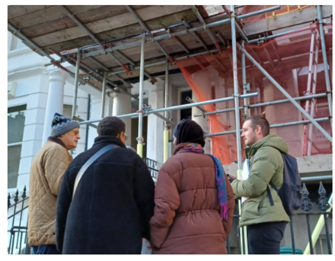
Residents touring Earl's Court November 2023

Our contractors are representing us when they enter your homes. Both you and us are trusting them with the responsibility of ensuring everyone feels safe and comfortable living there and we expect our contractors to take that responsibility seriously. We know the behaviour and professionalism of contractors goes a long