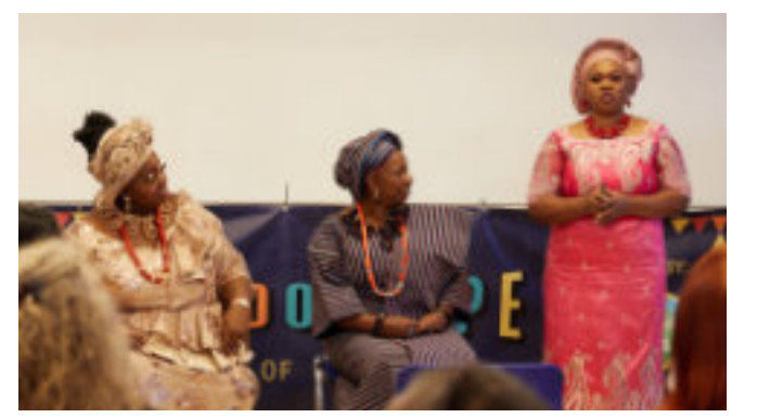
Above: residents from the Aylesbury estate celebrating Black History Month. Below: Cookery classes at in the Old Library at Grahame Park