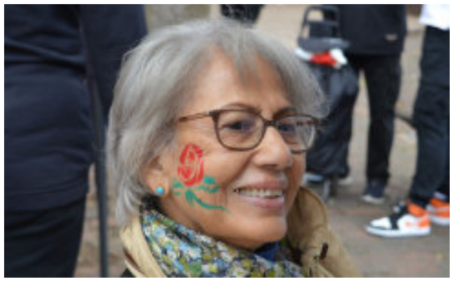
Black History Month an afternoon of music, culture, and delicious Caribbean food.

For Black History Month, the Grahame Park community was treated to an afternoon of music, culture, and delicious Caribbean food. Co-ordinated as part of Animating the