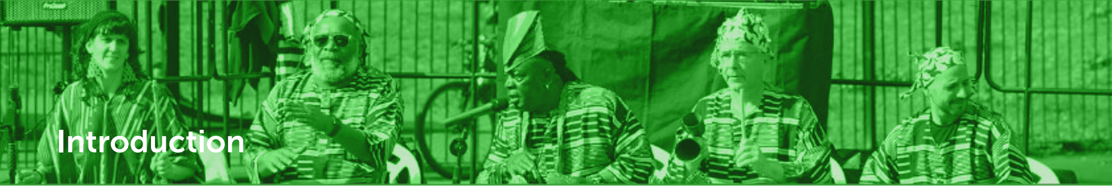
The Resident Voices Group (RVG) is led by residents, for residents, with representation from all parts of the resident involvement network and resident members of the governance community, such as resident board members and resident committee members. We work collaboratively with Notting Hill Genesis (NHG) staff, and act as the hub where resident feedback intersects with senior NHG staff and the group board, influencing improvements and the future direction of the services NHG provide their residents.

We regularly review feedback from resident involvement groups and Residents' Associations, as well as feedback from