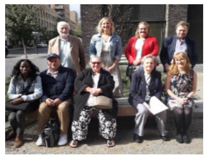
Some members of the Resident Voices Group on a visit to Royal Albert Wharf, Newham