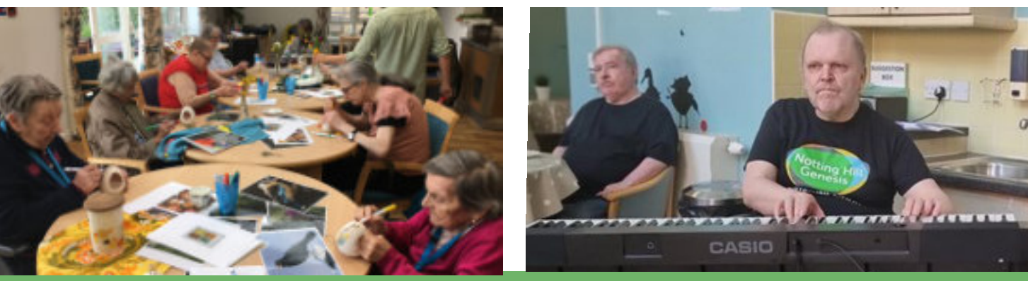
Notting Hill Genesis residents at various events in 2022